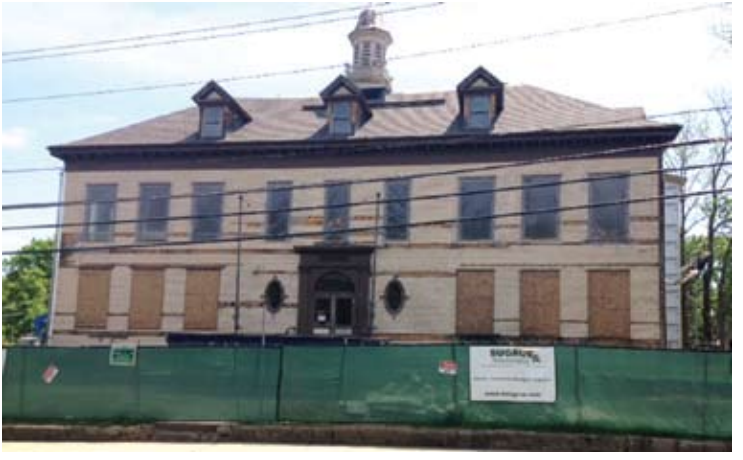
Conversion of the former Blanchard School in Uxbridge into apartments proceeds toward a December completion date.

The event will be held on the sidewalks and street with tables, pop up tents and displays. Church Street will be closed to traffic that day from Pine Street to Cross Street from 9 a.m. to 3 p.m.