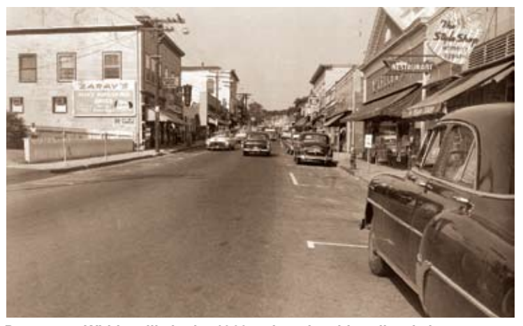
Downtown Whitinsville in the 1960s when the sidewalk sale began.

Nearly two dozen stores in and around the downtown area will be represented with the theme of Eat, Shop and Play.